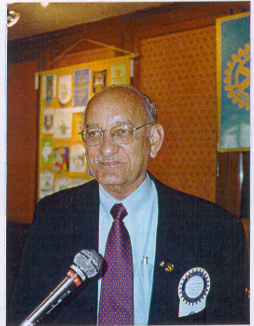
PDG Mike Fennell – from the greatest Olympic Games to the greatest Rotary Club.