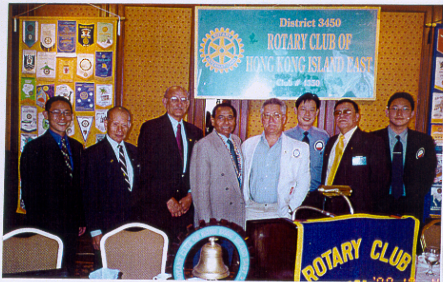
Visitors & guests to the Club on 4 th October, 2000.