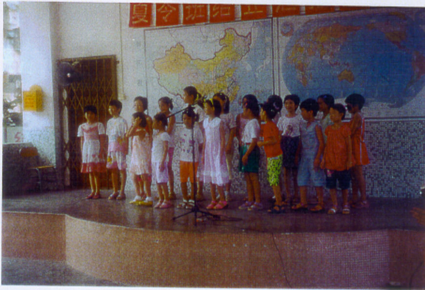
Farewell performance by students in the Drama Class.