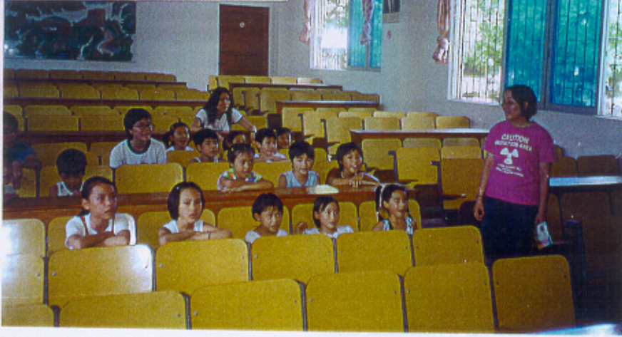
Students with Rotaractors in Liberal Arts Class.