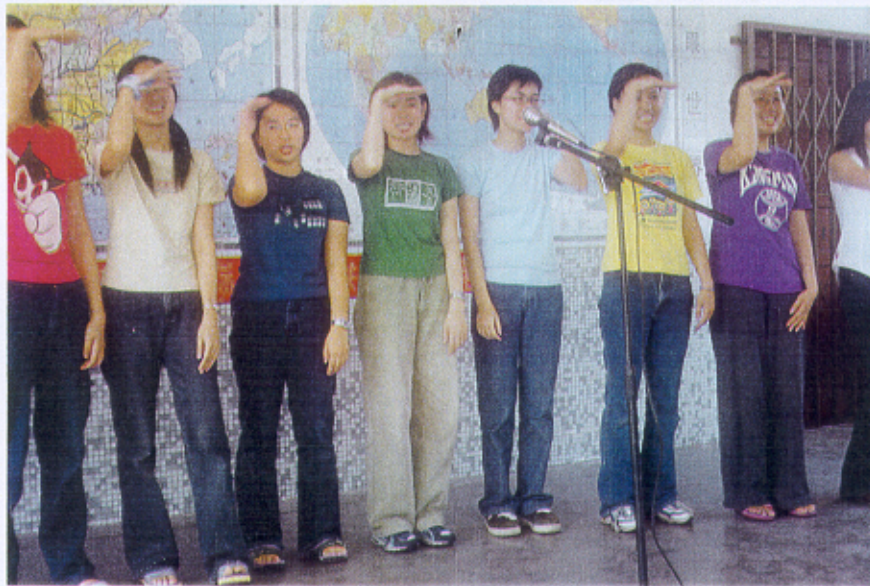
Lingnan Rotaractors performing a skit show.

Zhongshan Ming Lok Middle school. Lingnan University Rotaract Club Project, 3 rd Annual Summer Project.