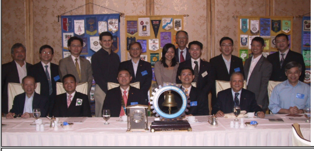
Group photo with members, Ambassadorial Scholars & visiting guests