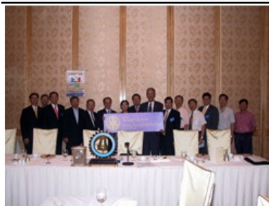
Group Picture with visiting guests.