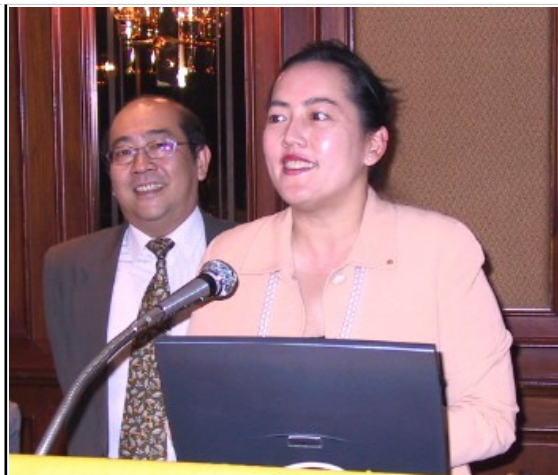
AG Ada also reminded us to support the Area 3 joint function which will take place on the 7th of October (Thursday)..