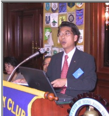
Acting SAA PP C.Y. doing a great job.