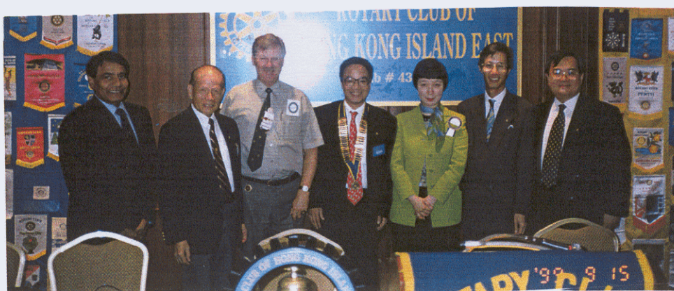
Visitors, Rotarians & guest on 15 Sept 99.