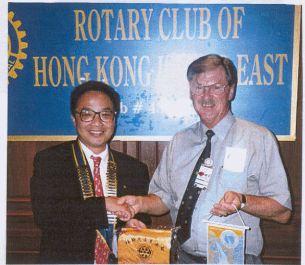
Greetings from "Down Under".

THE ROTARY CLUB OF HONG KONG ISLAND EAST 香港東區扶輪社週報