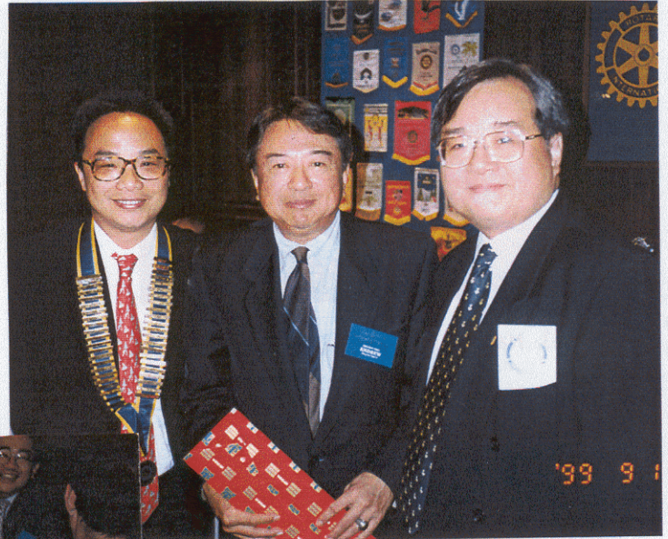
Let's hope Long Jong didn't choose my gift.

THE ROTARY CLUB OF HONG KONG ISLAND EAST