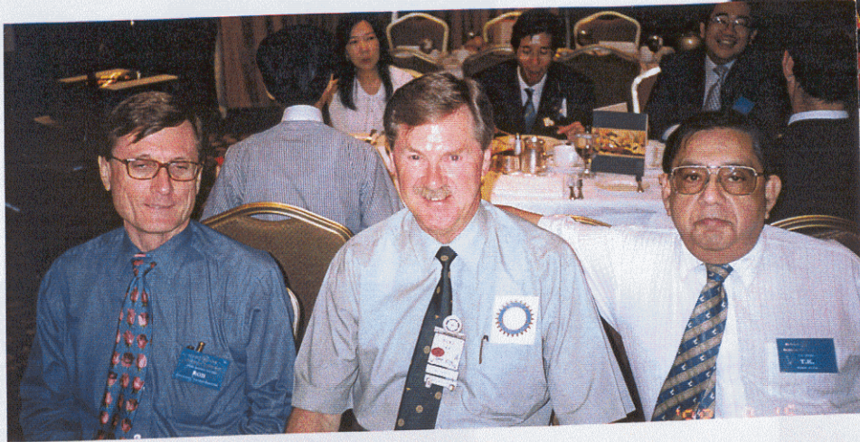
These antipodeans always stick together!