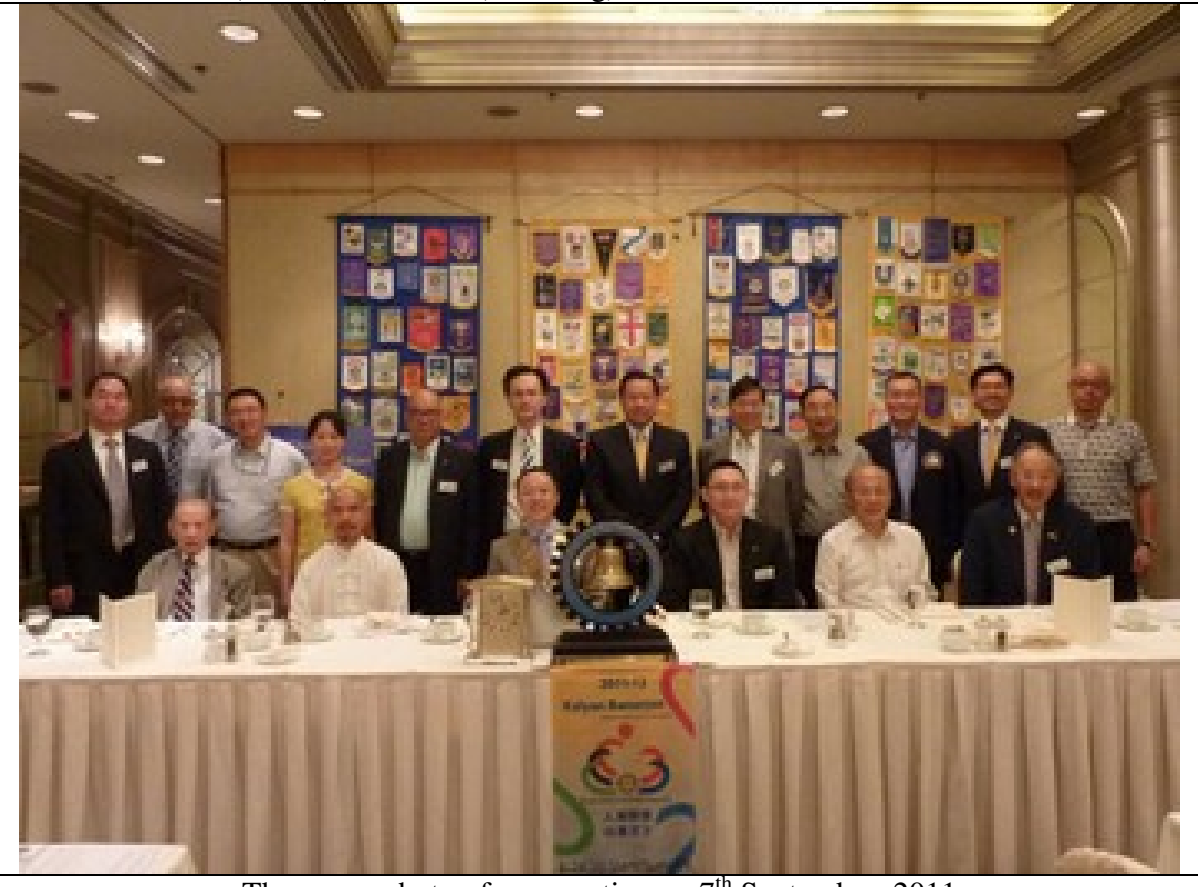
The group photo of our meeting on 7<sup>th</sup> September, 2011