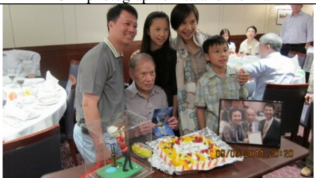
A family group photo of his family and presents and the birthday cake.