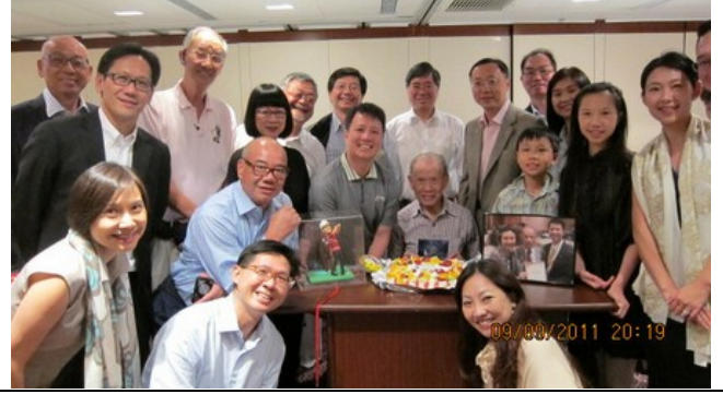
A happy group photo of the Rotary family and friends