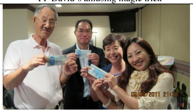
We raised a few bucks at that