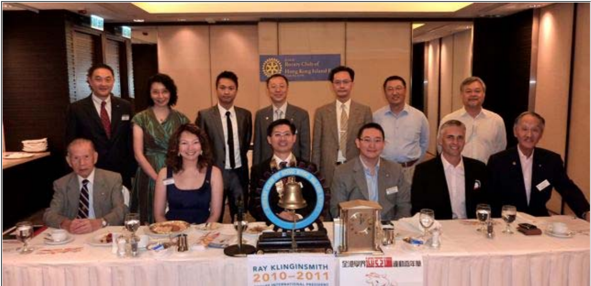
Group photos with members, speaker & visiting guests