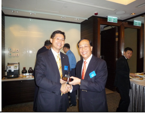
The speaker demonstrating the LED light fixture