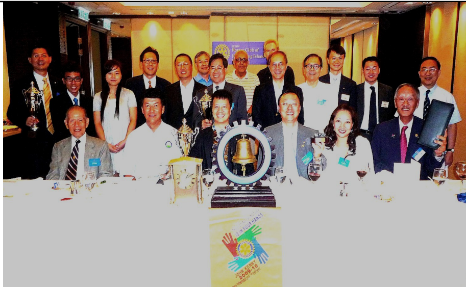
The group photo of our meeting showing all the winners of the golf and members of the club and guests