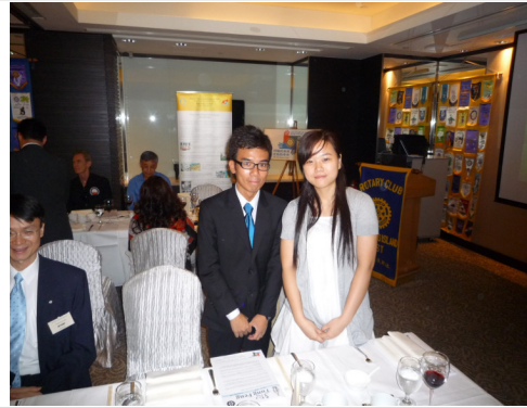
Our two guests from Rotaract Club of Lingnan U.