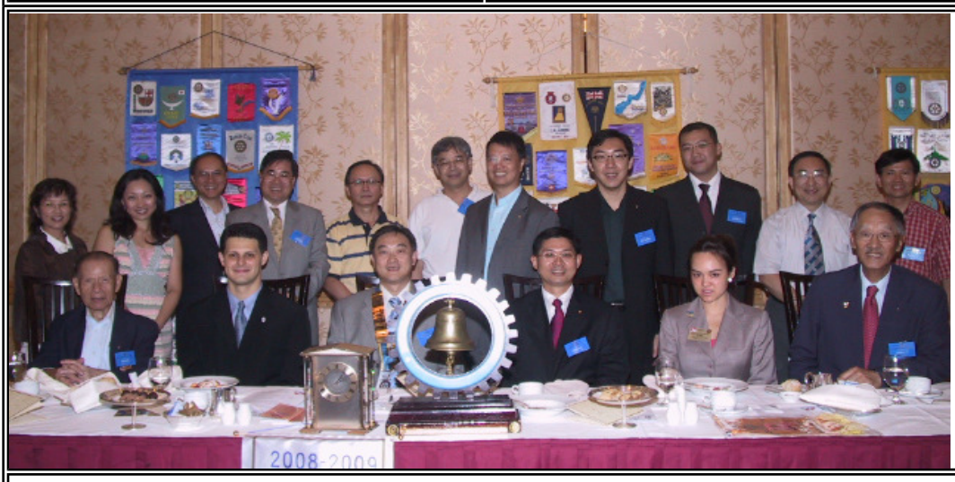
Group photo with members, Ambassadorial Scholars & visiting guests