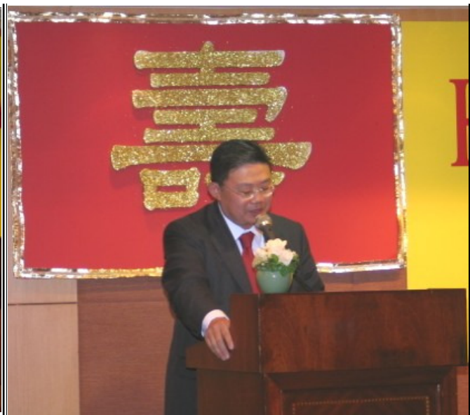
PDG Y.K. welcomed everyone to the party.