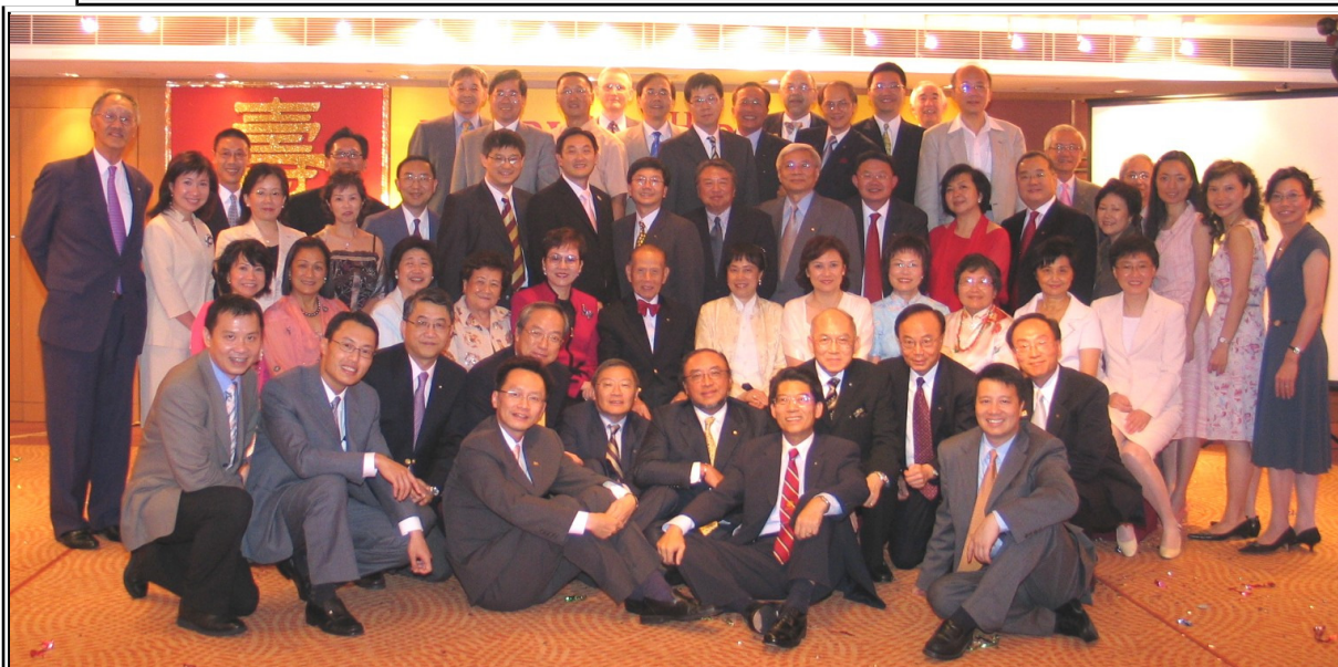
Group Photo of all those who were at the party on 6th of September, 2005