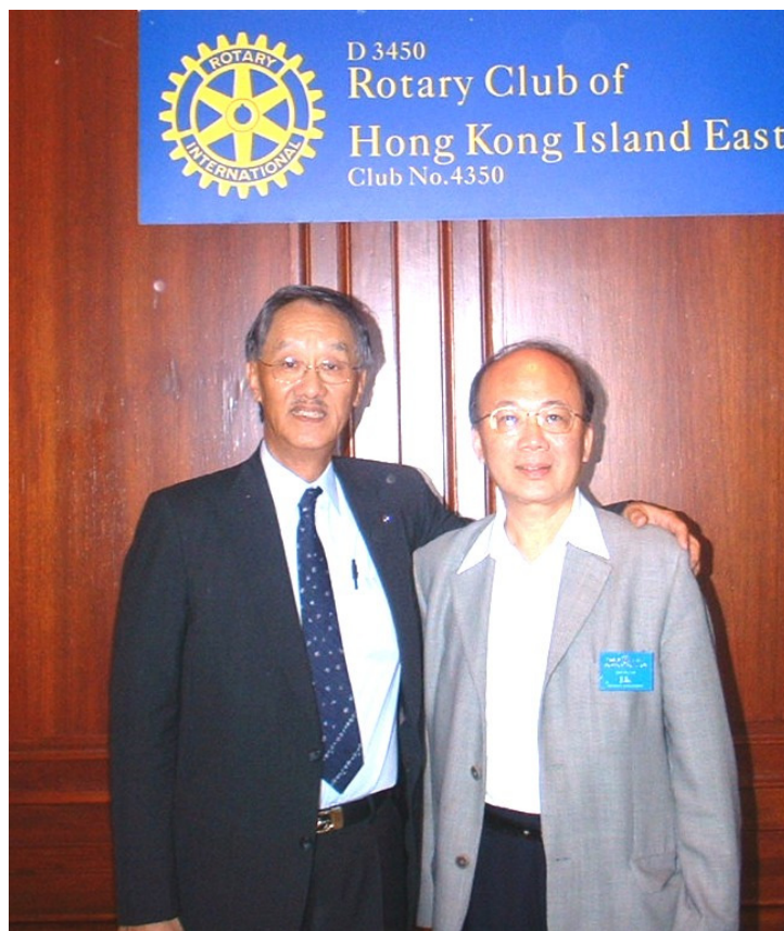
Two John's pictured here in mutual admiration in the Rotary spirit of course, what were you thinking?