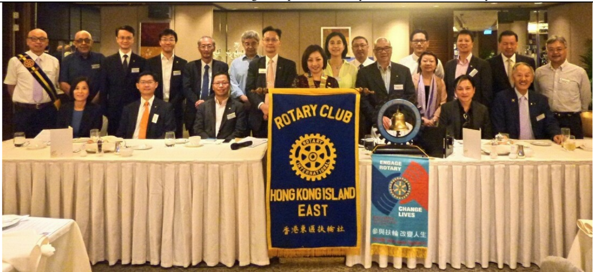
The group photo of our meeting on 11 th Sept., 2013