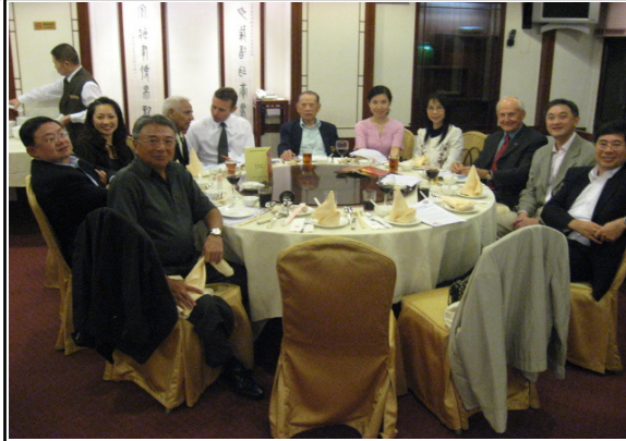
Members of RC of HKIE, visiting Rotarians and guests