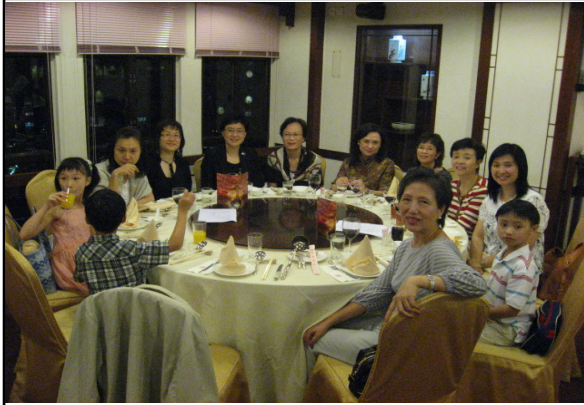
All the Rotariannes & families members