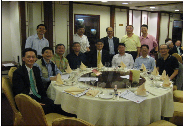
Members of RC of Hong Kong Island East