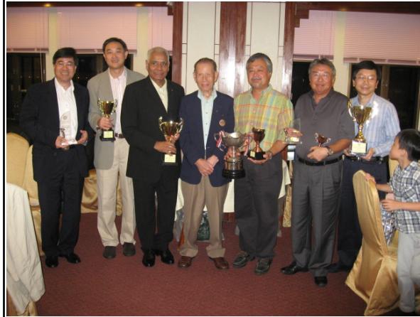
Group picture with all the winners