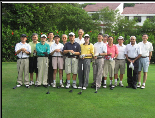
Participants of Uncle Peter Cup Golf Tournament