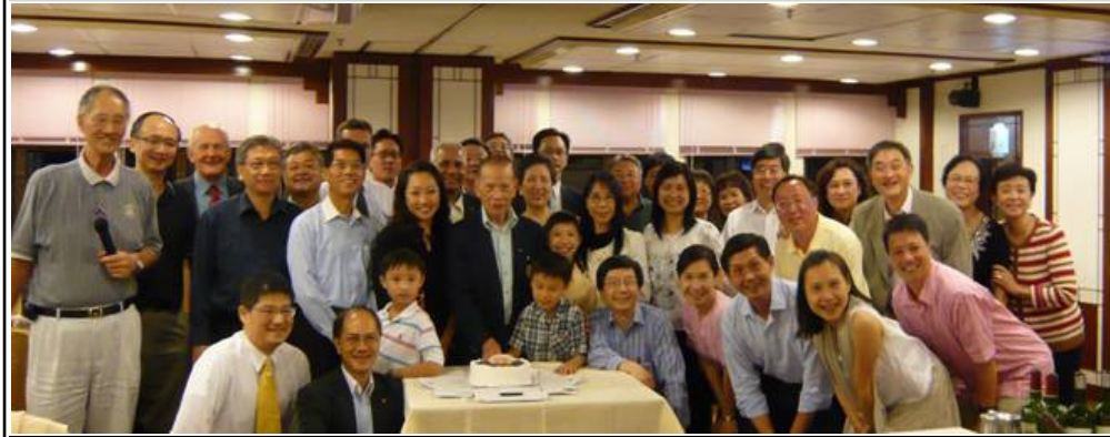
Group photo with members, Rotariannes & family members, visiting Rotarians and guests