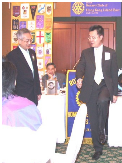
The speaker demonstrating how our bodies are balanced while we are walking normally.