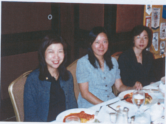
Visiting Rotarians from Peninsula South.