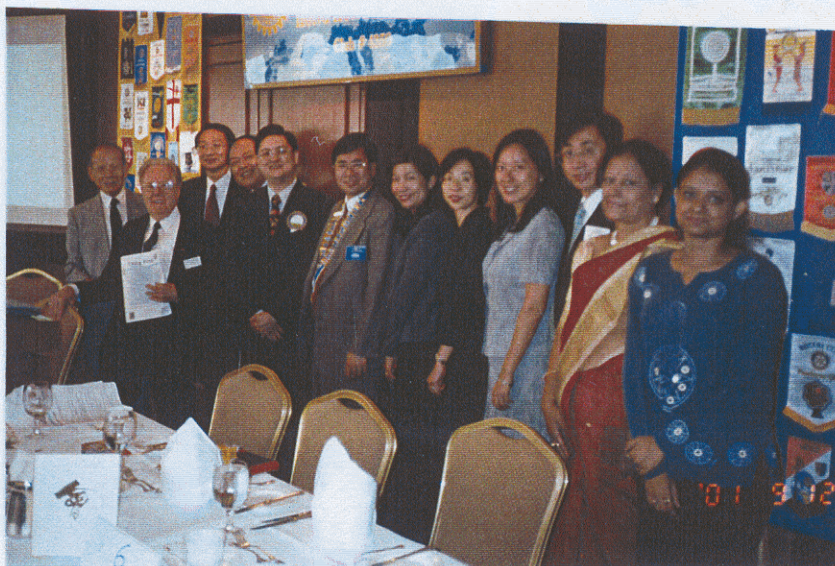
Group photo of Sept 12, 2001.