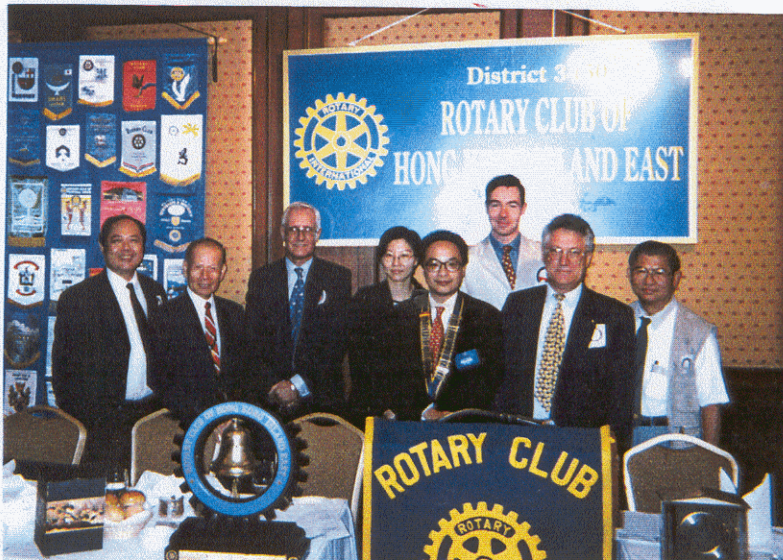
Visitors & guests to the club, 1 Sept., 1999