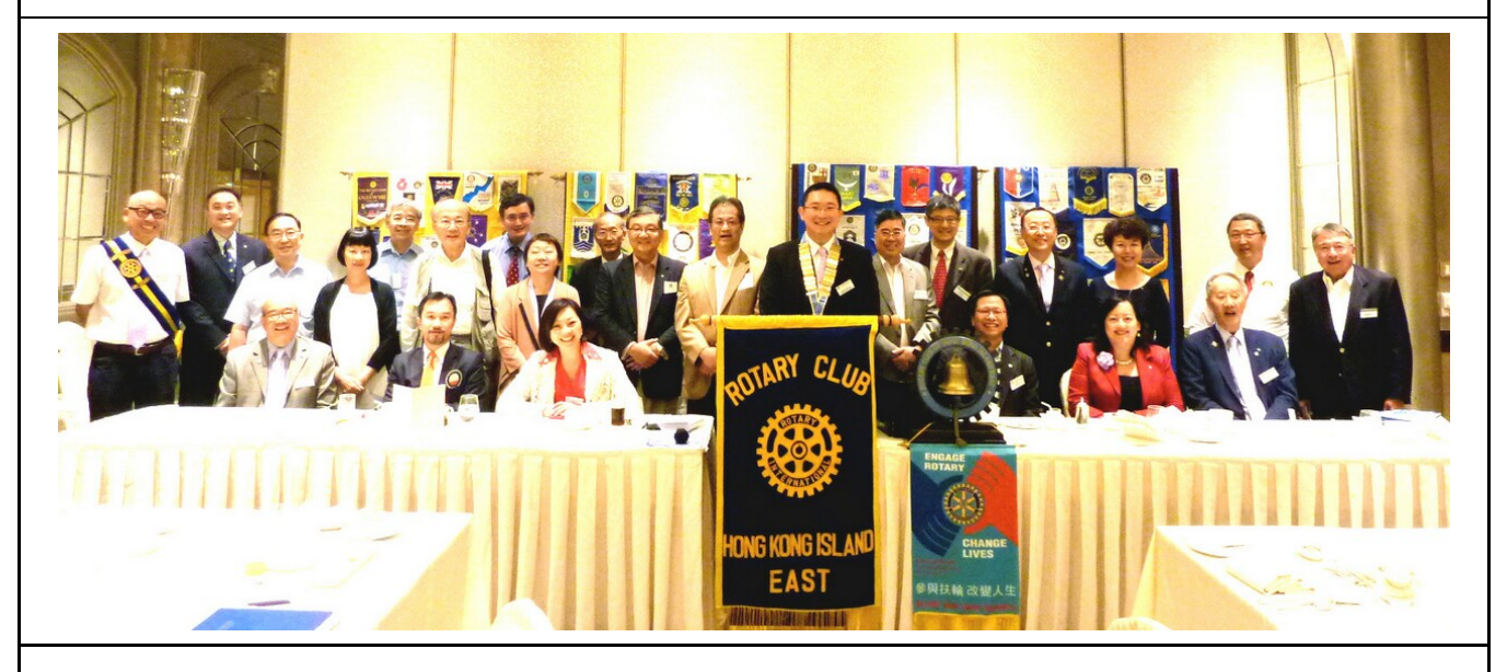
Group photo with members, guest speaker, visiting Rotarians & guests.