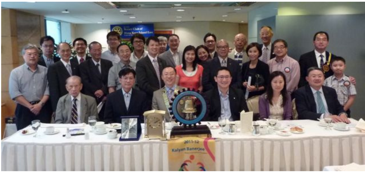
Group photos with Guest Speaker, visiting guests & club members