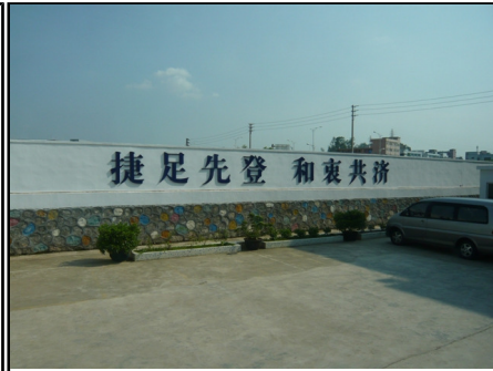
Motto of Chiaphua Industries Ltd. "Pioneering in Good Harmony"