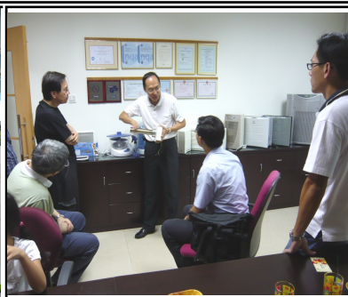
Members attentively listened to the characteristics of each of the products