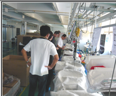
A quick tour at one of the production lines