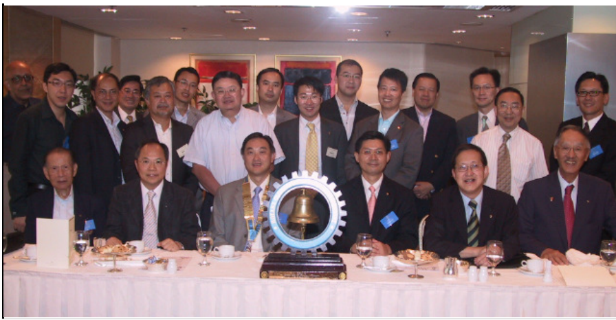
Group Photo with members, visiting guests & the speakers