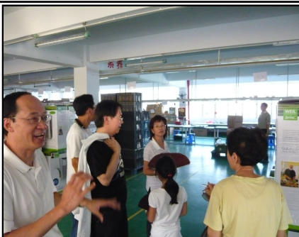
Explaining how the sampling testing was