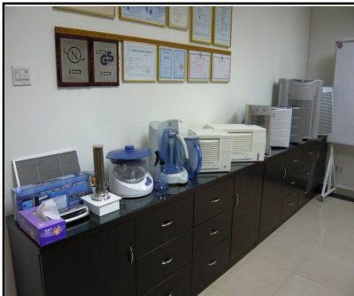
End products displayed included air purifiers and water sterilizers using patented nano-technology.