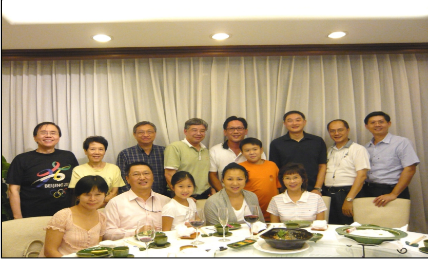
Group Photo with members and family at a delicious dinner after the vocational visit