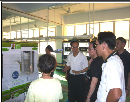
We were shown the QC process of the end products at the production floor