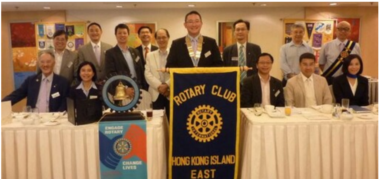
Group photo with members & visiting Rotarian.