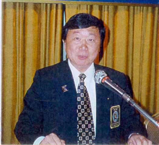
District Governor John Wan addresses the club.

Our website address : http://www.rotary.org.hk/hongkong-island-east