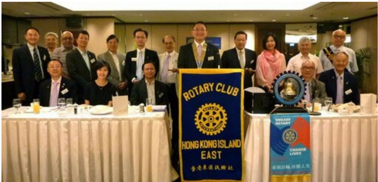
Group photo of members & guest speaker.