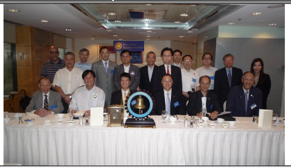
Group photo with members, speaker & visiting guests