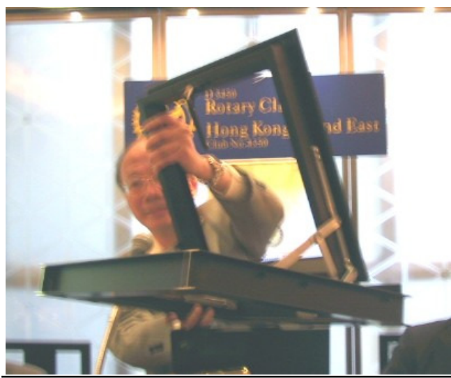
PP JL demonstrating an aluminum window frame.