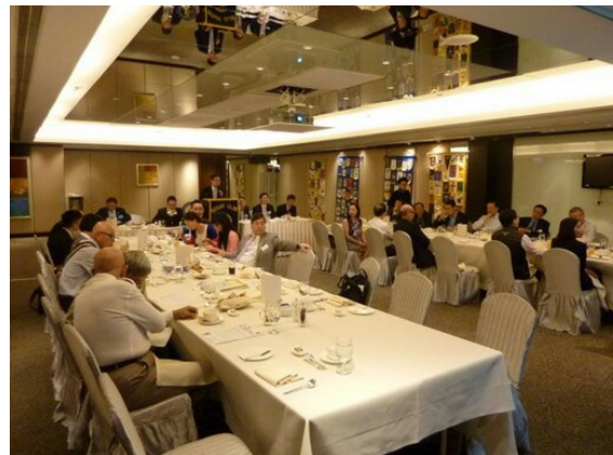
Photos of the luncheon meeting