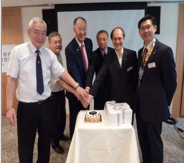
Cut cake ceremony for the 5 birthday boys