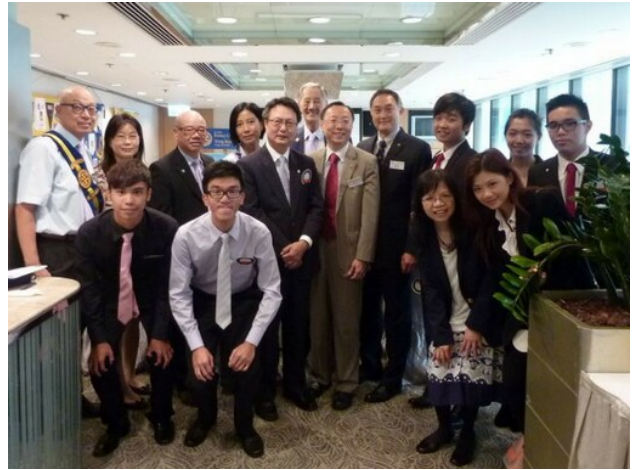
Group photo with members & advisors of Rotaract Club of HK Community College Student Unit.