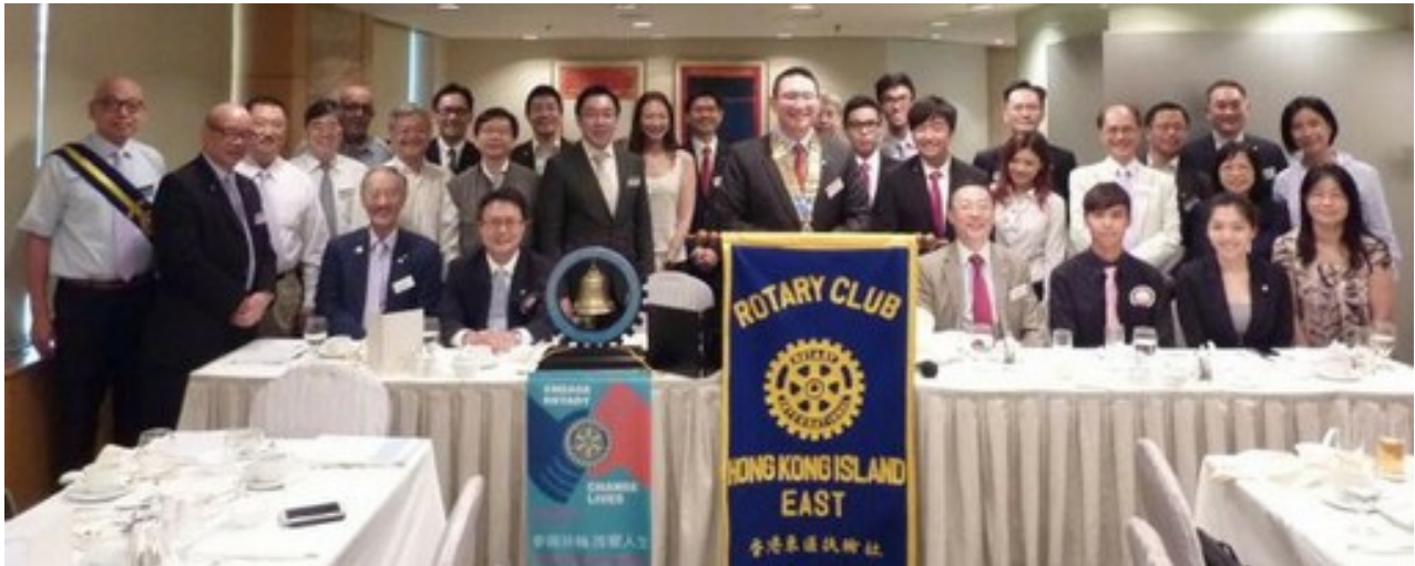
Group photo with members, guest speaker , HKCSS Advisors & Rotaractors of HK Community College Student Unit