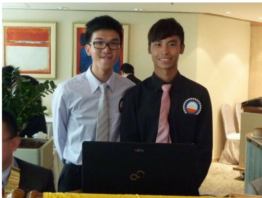
Rotaractors of HKCSSU reporting their Club projects and activities.