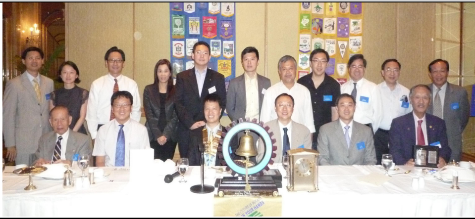
Group photo with members, speaker & visiting guests