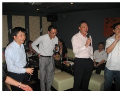
The Singing Quartet - Men's Team