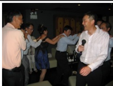
A dragon dance to mark the climax of the night