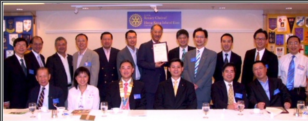
Group photo with members, speaker & guests