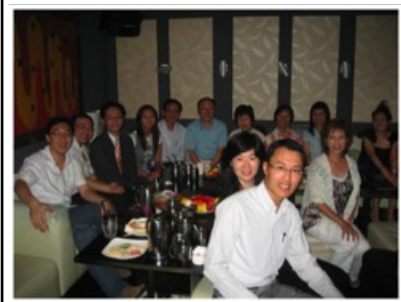
Get together for a group photo first