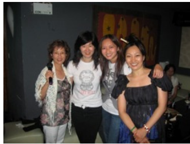
The Singing Quartet - Lady's Team