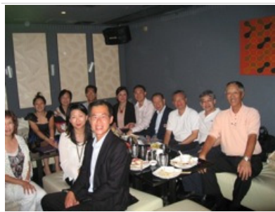
A second shot to complete the group picture