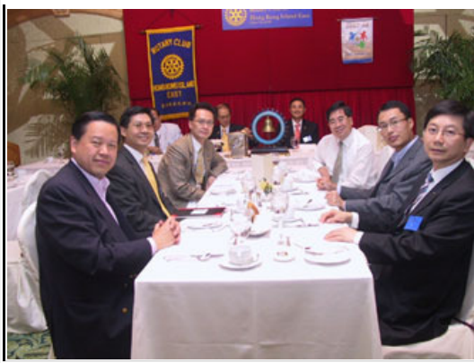
Members at the new luncheon meeting venue - Regal Hong Kong Hotel