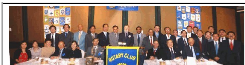
Photomerge of the group picture of our visiting Rotarians on 23rd July, 2003.