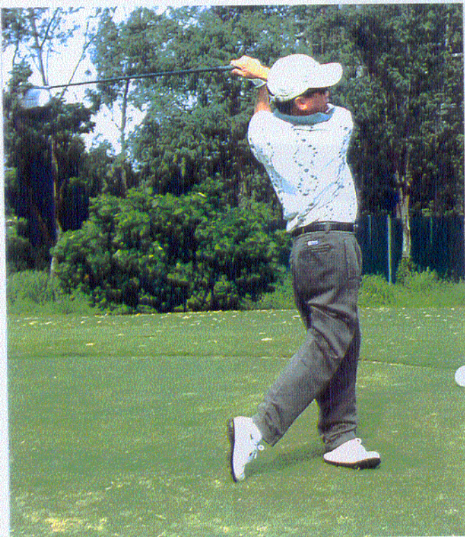
The swing of Enteng.