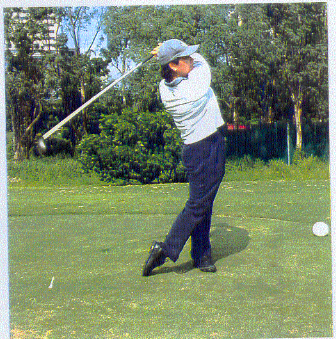
The swing of Marrison.