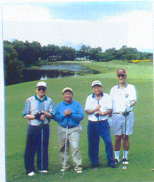
Arriving at the 17 th hole are the two really potential winners & they are not from Hong Kong Island East.