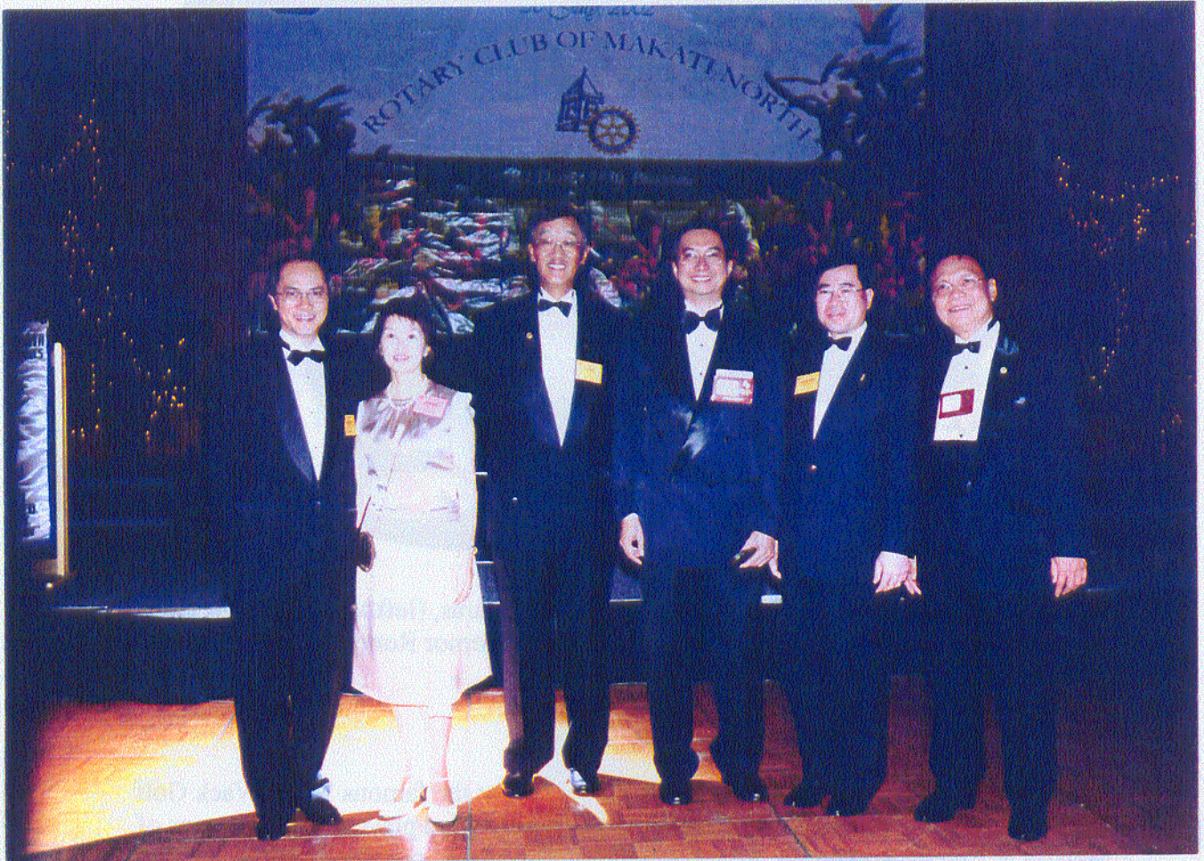
The Main purpose of our trip was the induction ceremony of the Makati North Rotary Club. Here's the picture of our members taken with Pres. Orly & IPP Boy with the beautiful back drop at the ceremony.