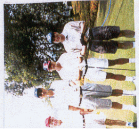
The reward for such a great job done with a game of golf