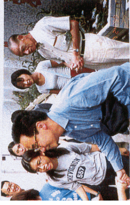
Pres. Desmond thanking the Rotaractors for their good job done