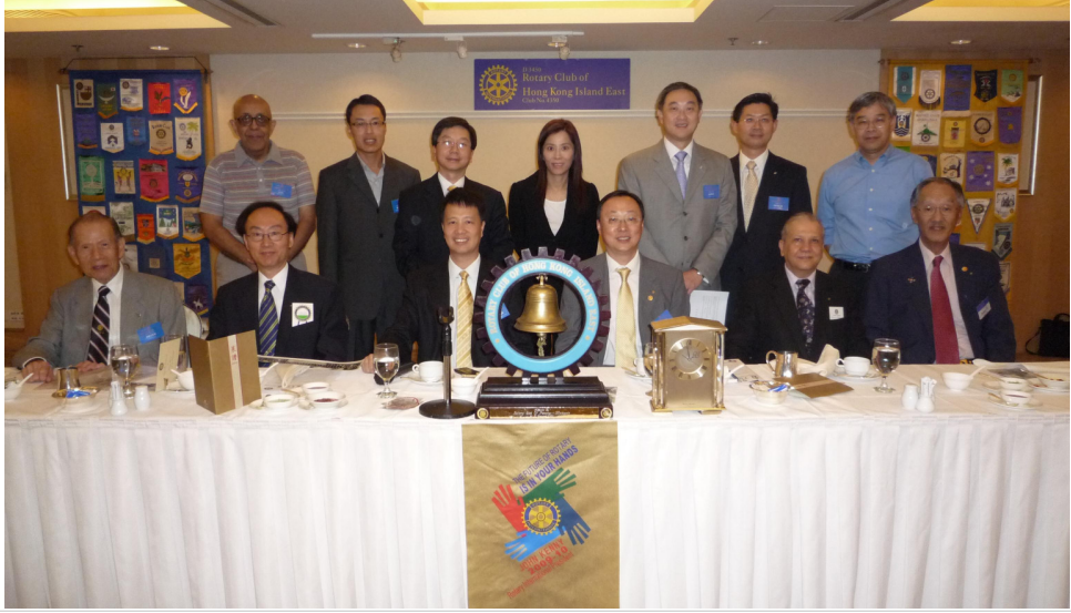
Group photo with members, visiting Rotarians & guest