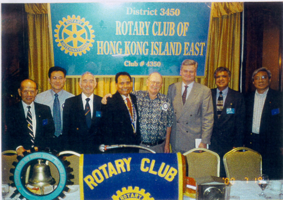
Visiting Rotarian & guests with the godfathers of the club on 19 th July, 2000.