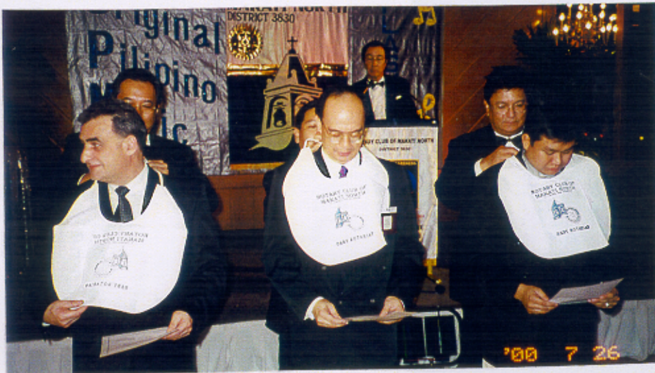
Sponsoring Rotarians putting the bibs of their new "baby" Rotarians.