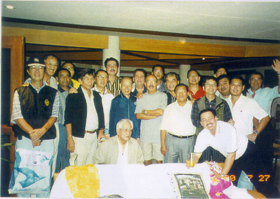
The final day's prize presentation was attended by all players.

香港東區扶輪社週報 THE ROTARY CLUB OF HONG KONG ISLAND EAST