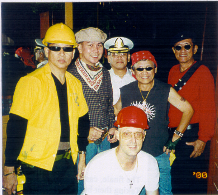
The whole casts of players in their costumes. Can you guess who they are?