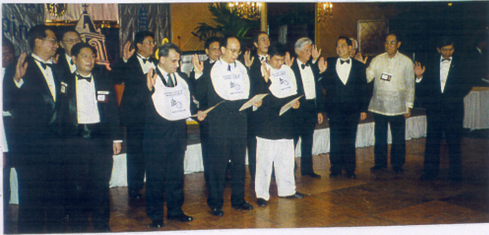
Swearing in ceremony of three "baby" Rotarians with their Sponsors.

香港東區扶輪社週報 THE ROTARY CLUB OF HONG KONG ISLAND EAST