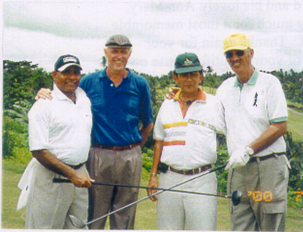
The top golfers of the tournament cross their weapons before teeing off.