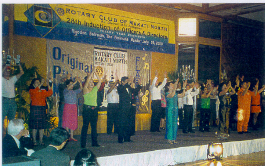
The finale, cast of "thousands" Taking their bows. Bravo!!!