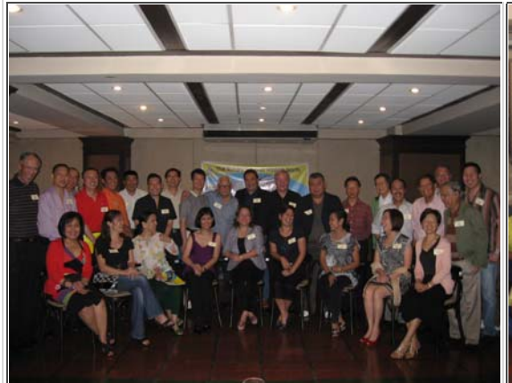
A Group Photo of the entire party