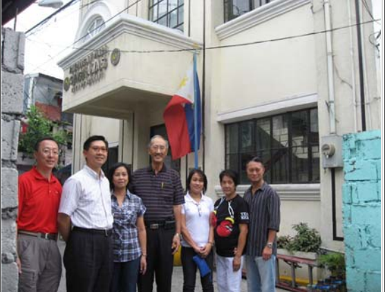
We were shown their reading room in a separate building

We were treated to a delicious lunch of sea foods hot pot