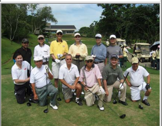
We played a round of golf at the Sun Valley Golf course