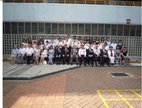
Graduation photo with students, teachers, parents & guests