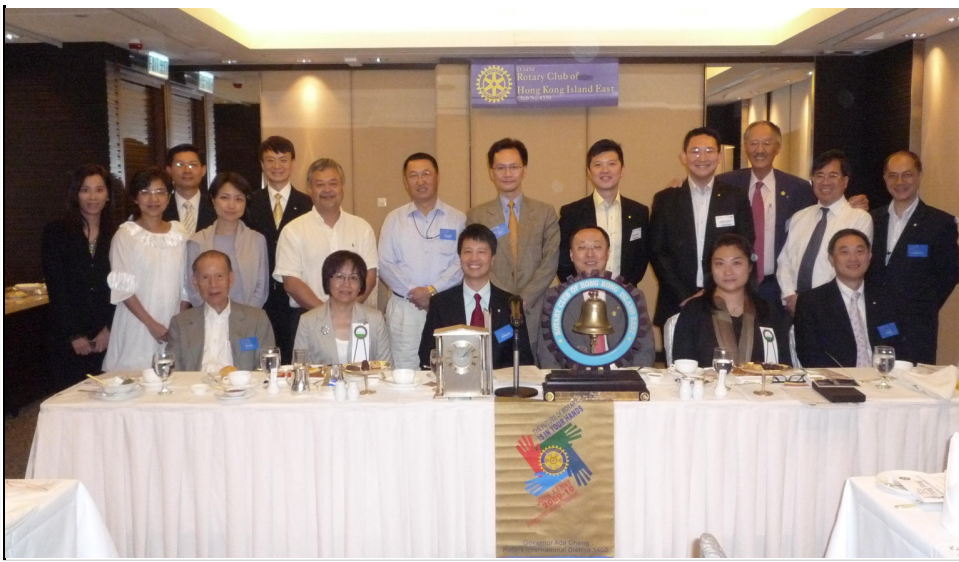
Group picture with speakers, members and visiting guest