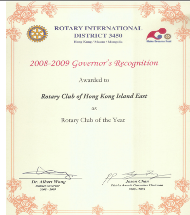
Rotary Club of the Year