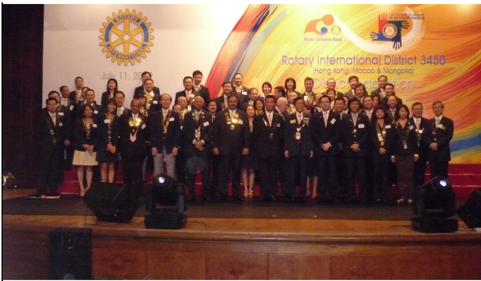
All the 2008-1009 Presidents on the stage