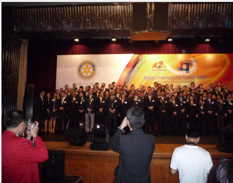
All 2008-2009 & 2009-2010 Presidents were on the stage for the installation ceremony