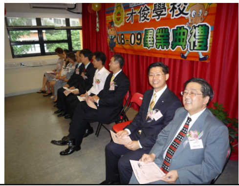
All guests be seated for the graduation ceremony