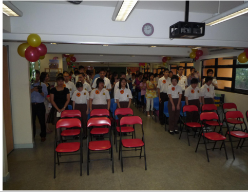
The first two rows are the graduation students