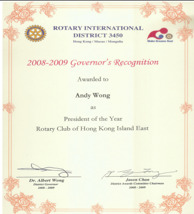
President of the Year