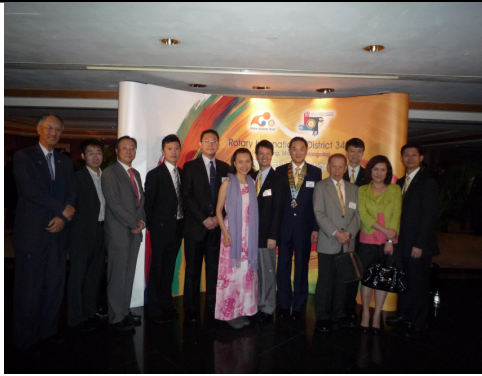
Members of HK Island East & their Rotarians attended the District Installation at the Grand Hyatt Hotel