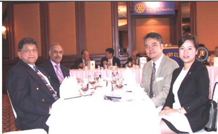
Four visiting Rotarians from TSTE.