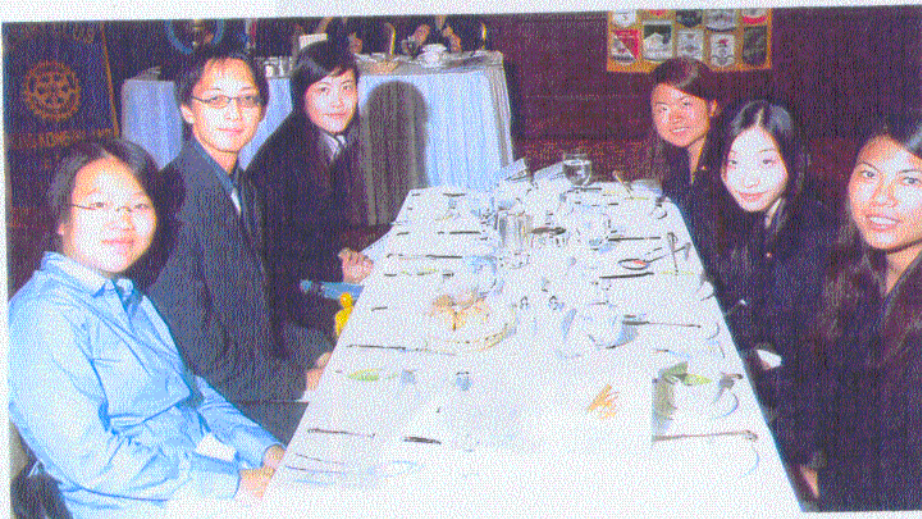
Some of the Representatives from the Rotaract Clubs of Lingnam University, who had just completed their trip to Zhaoqing.