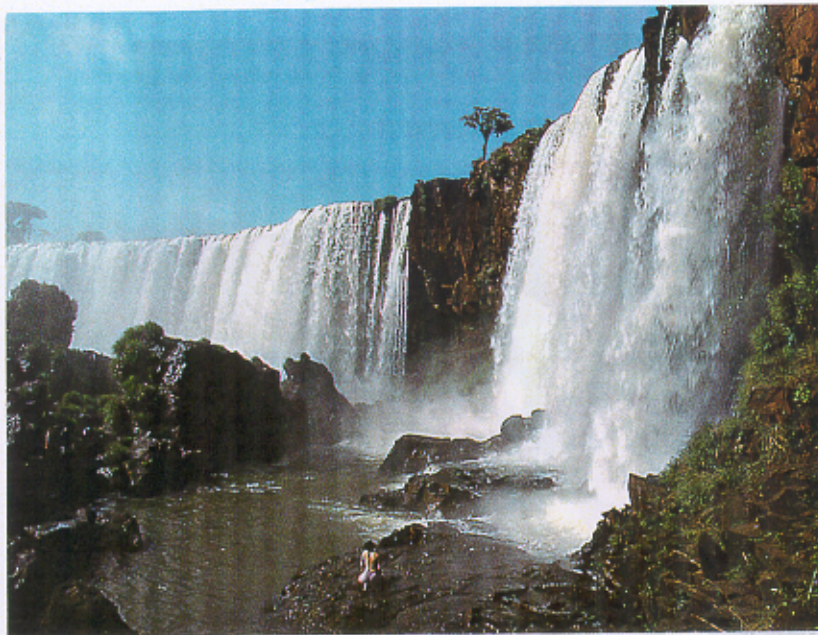
The world famous water fall "Iguassu".