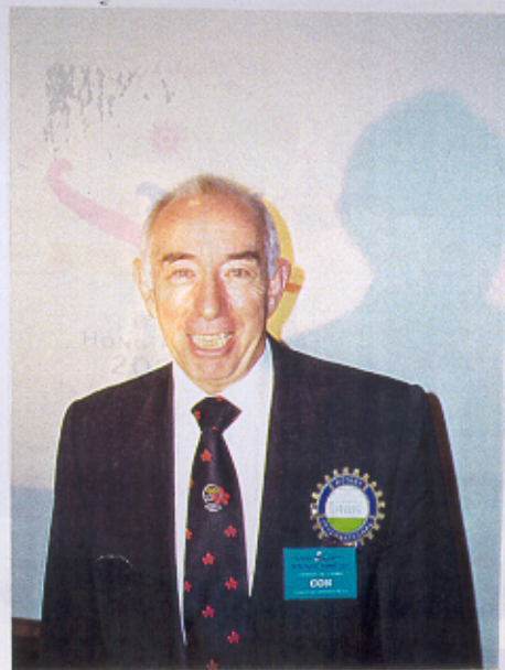
PP Con struts his stuff.