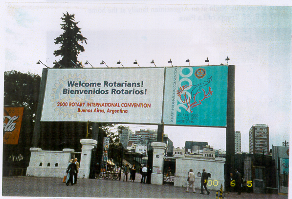
The Main Entrance of the Convention site - La Rural, Buenos Aires.