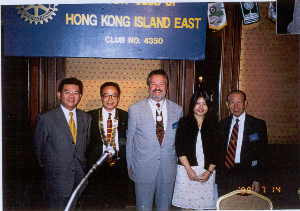
Guests to the club 14 July, 1999