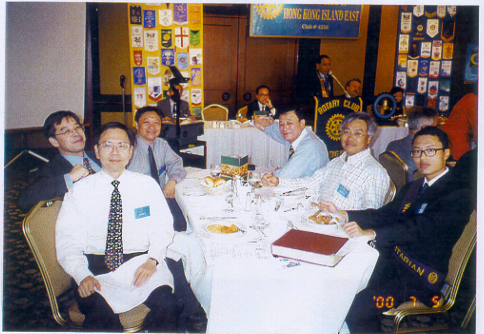
This looks like a very happy group for the first meeting of 2000-2001.