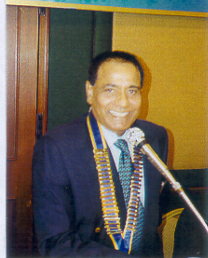
A very happy President on his inaugural debut.