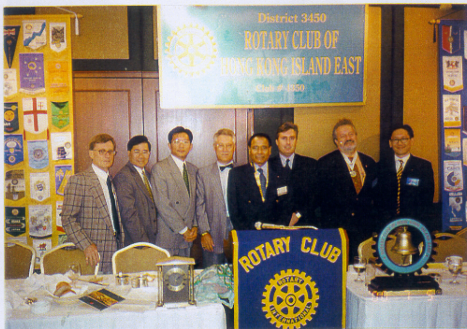
Visitors to the Club, 5 July, 2000