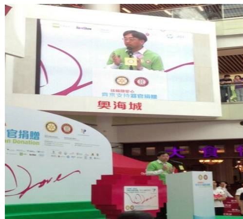
Dr. Ko Wing Man Speeches