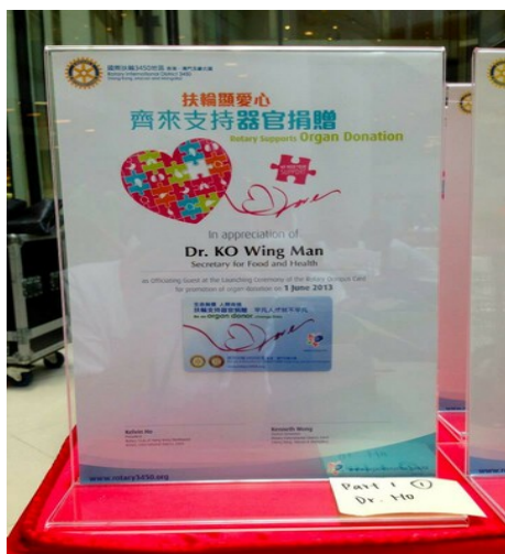
Dr. Ko Wing Man Organ Donation Card