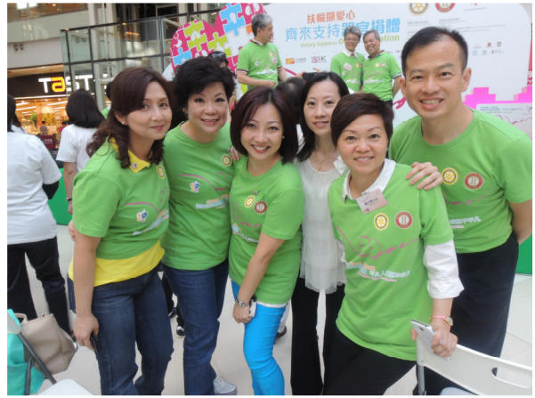
6 Presidents of this year