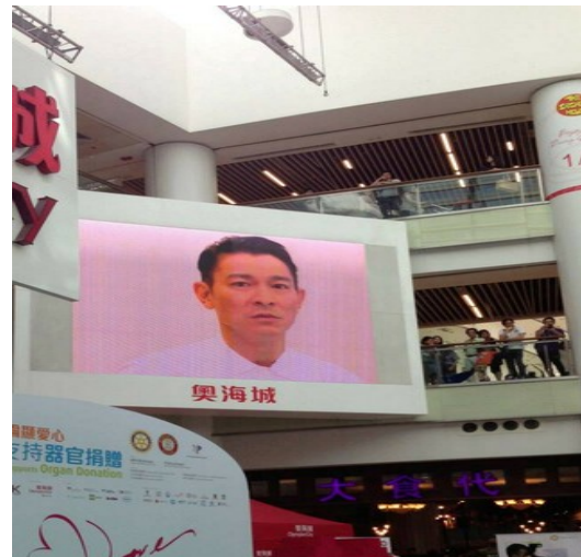
Andy Lau promoted Organ Donation through the video wall