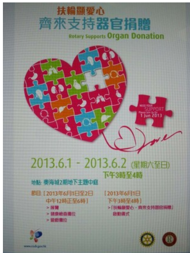
Organ Donation Poster