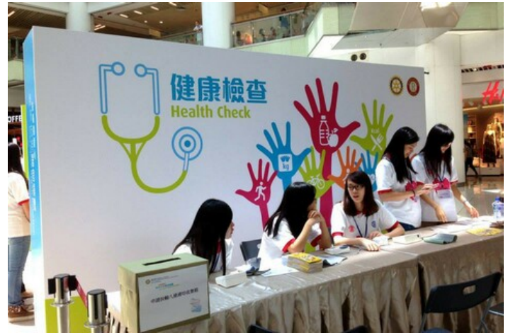
Health Check Counter