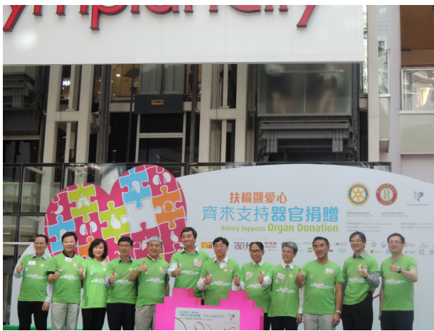
All guests of honor