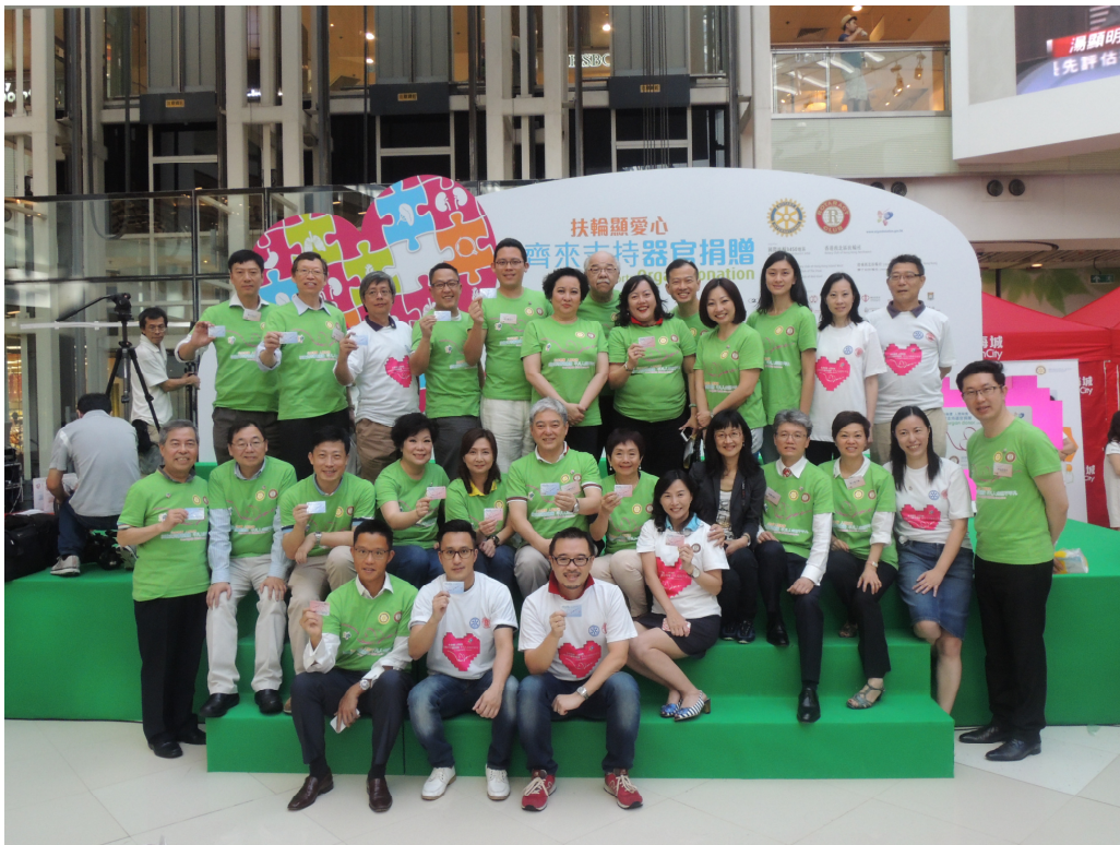
Part of the participants (above) & HKIE's family participants (below)