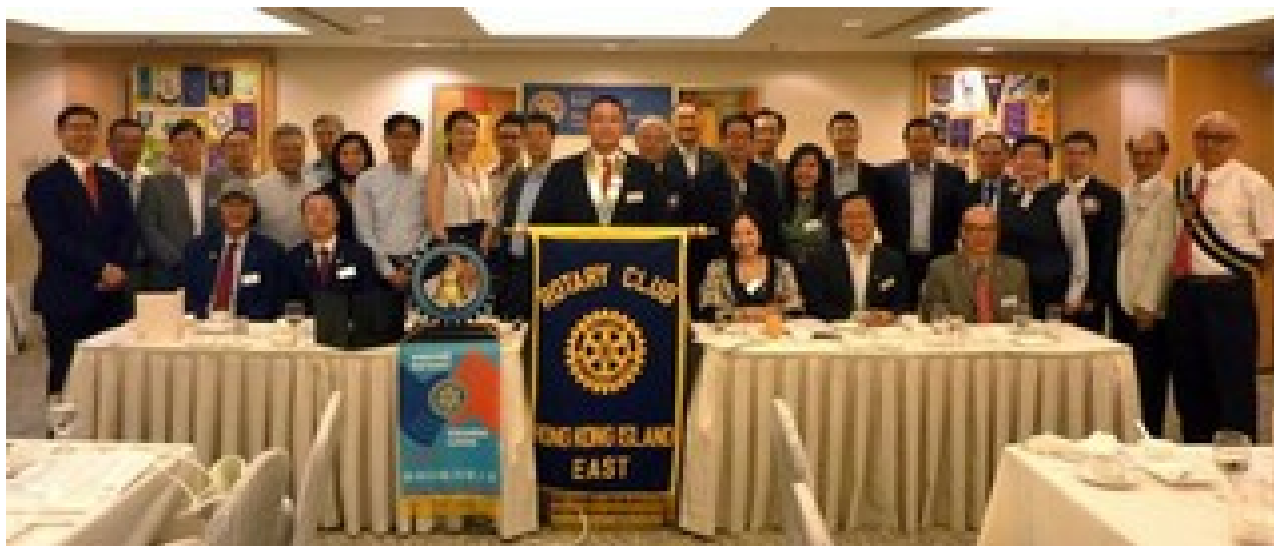
Group photo with members and visiting guests.