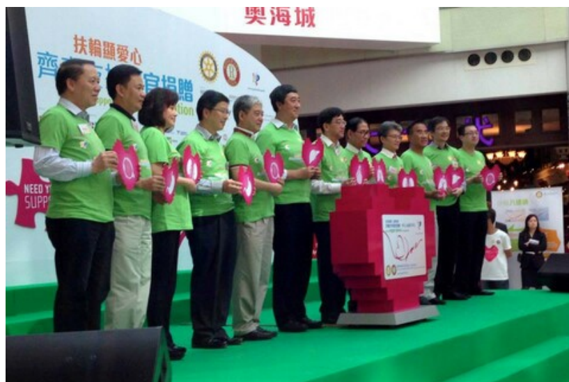
All guests of Honor