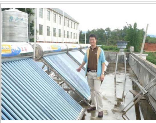
Pres. Norman inspecting the solar heating system