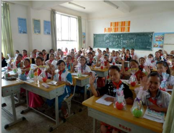
All students received a stationery set sponsored by Rotarianne Olivia, showing their happy face