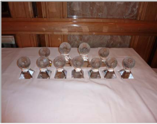
The trophies of PP Andrew Chen Cup Golf Tournament