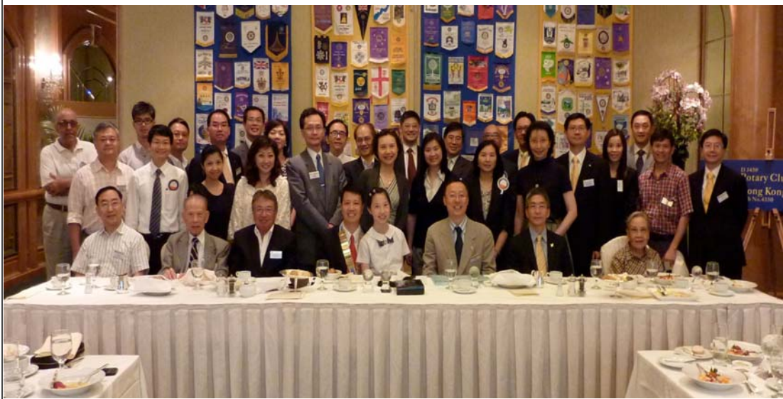
Group photo with members, visiting Rotarians & visiting guests