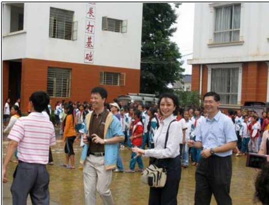
The students dancing the minority tribal dance every day