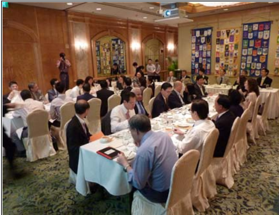
We had a full house in the last meeting of the 2009-2010 Rotary Year