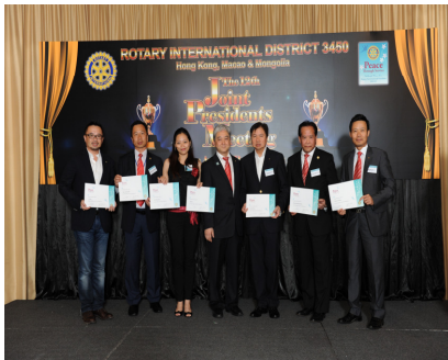
Area 6 Presidents received their Presidential Citation Award