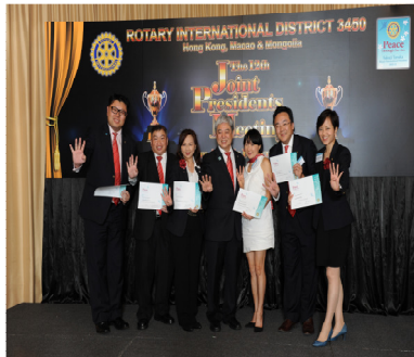
Area 4 Presidents received their Presidential Citation Award