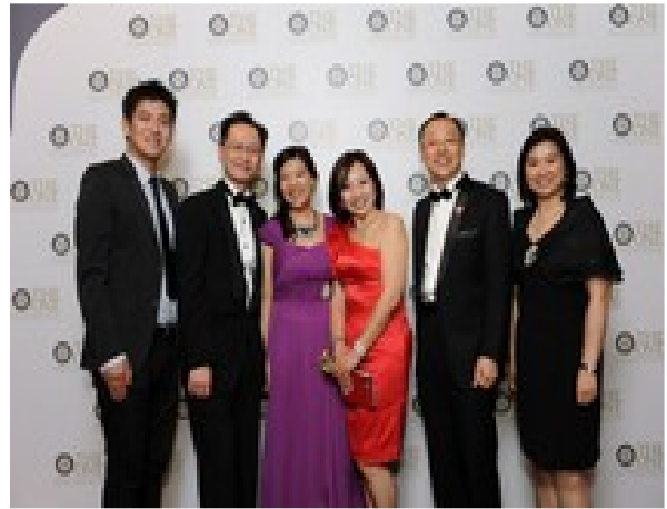
HKIE's members who attended the event on that night