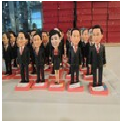
Q model of some Presidents