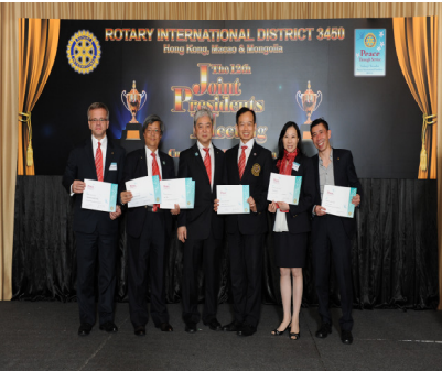
Area 7 Presidents received their Presidential Citation Award