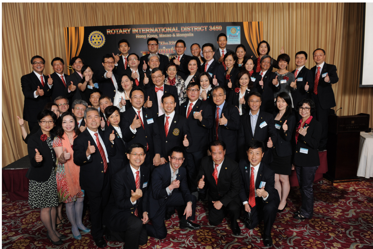
District Officers & Presidents of that night