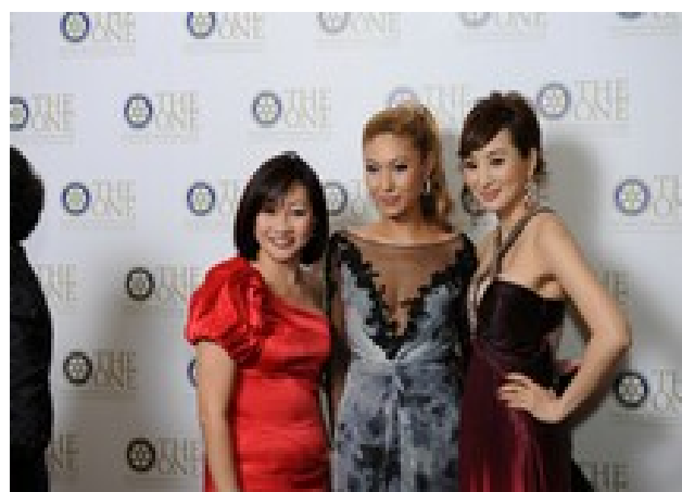
Pres. Nancy with 2 of the celebrities