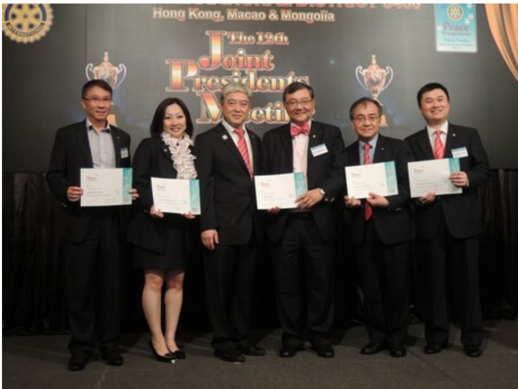
Area 3 Presidents received their Presidential Citation Award