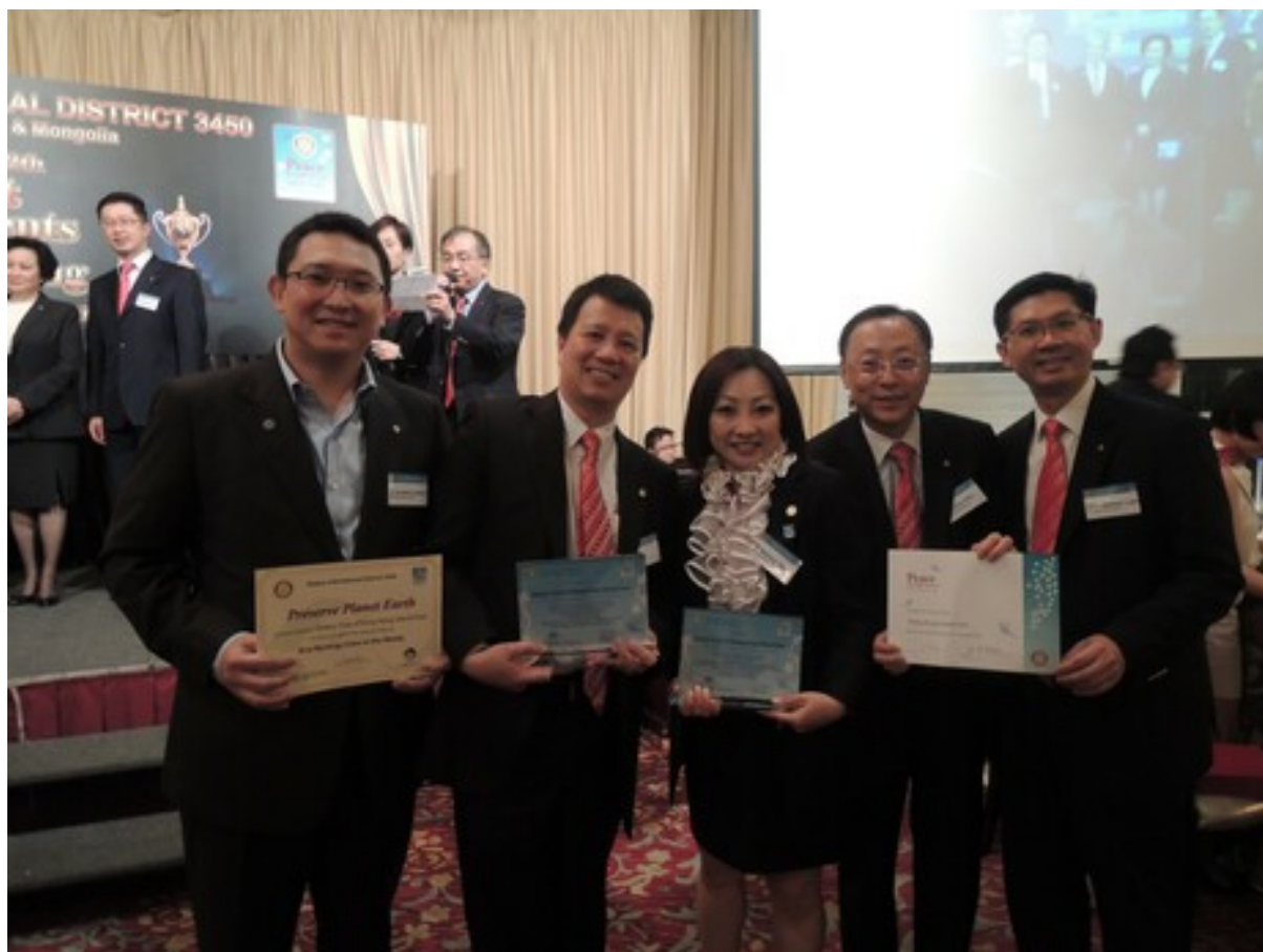
Bravo ....HKIE won 14 District Awards plus One Presidential Citation Certificate Awards and One Preserve Planet Earth Certificate Award on last JPM