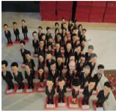
Q model of Presidents in this year