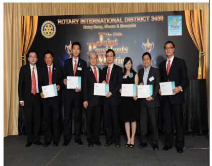
Area 8 Presidents received their Presidential Citation Award