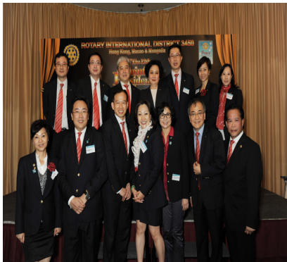
OC Team with District Leaders