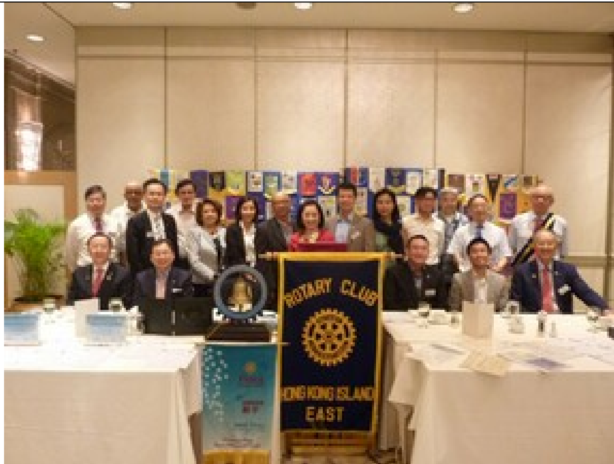
Our group photo on 26 th June, 2013