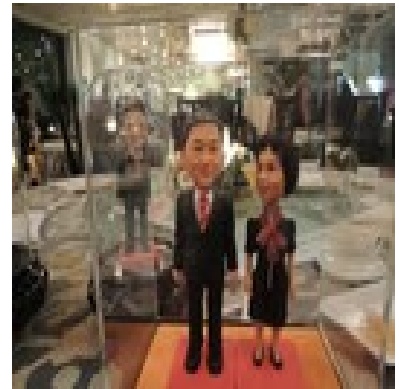
Q model of DG couple