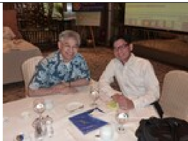
Two money men discussing about what? Money of course.