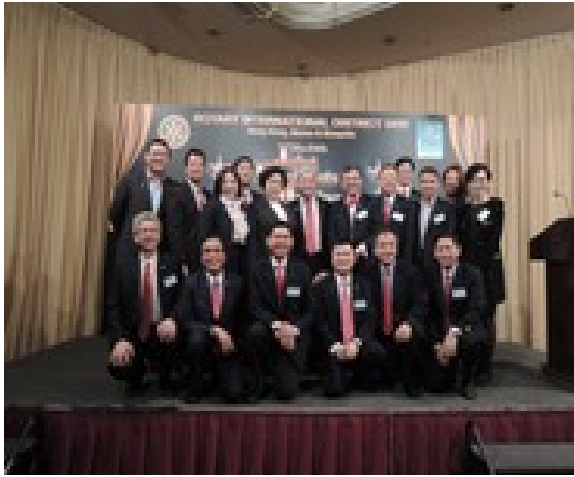
Area 3 members on that night