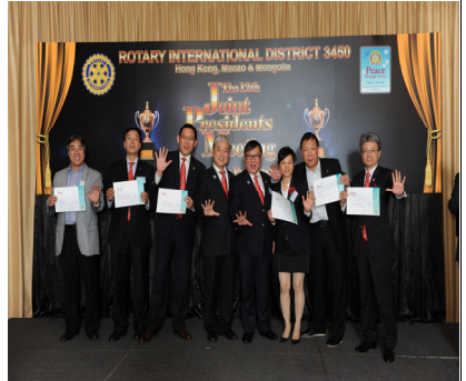
Area 5 Presidents received their Presidential Citation Award