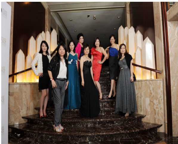
7 beauties Presidents of this year