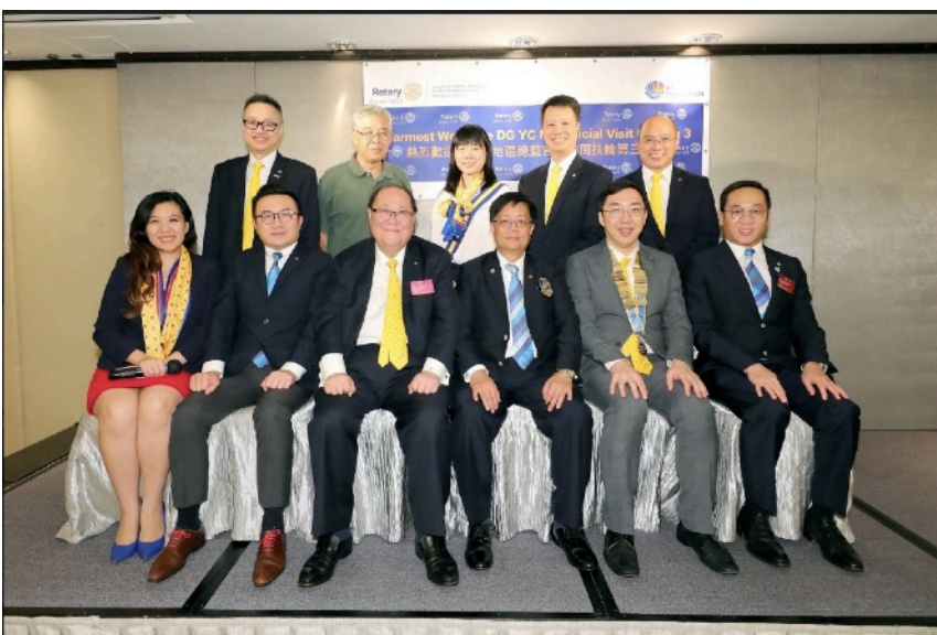
Members who attended the DG Visit: