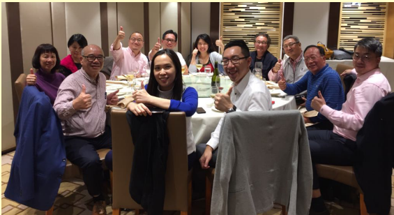
Fellowship dinner held on Friday, 24 Nov at Shanghai Fraternity Association.