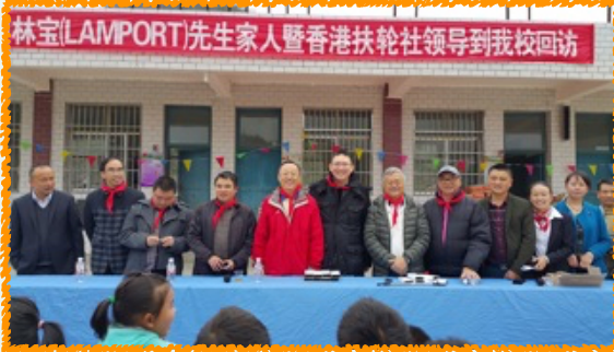
Visit to 林宝先生 (LAMPOR SCHOOL) 摆坝纪念小学